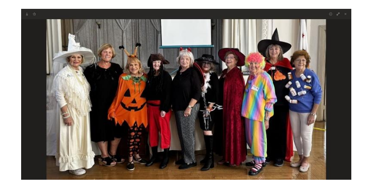
TWC Ladies in Costume