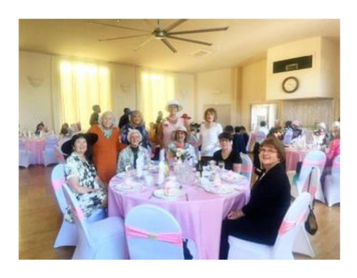
(Reprinted from the Marina District November Ship's Log)