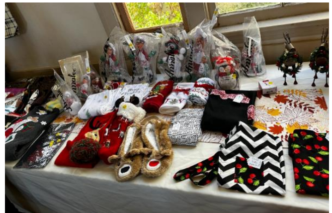
Goodies for purchase at November Xmas Boutique.