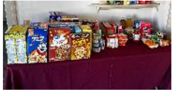
119 Food Bank Items were collected and donated to the Torrance Volunteer Center