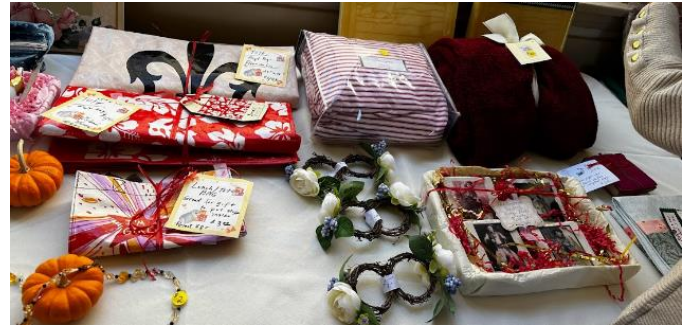
More items for sale