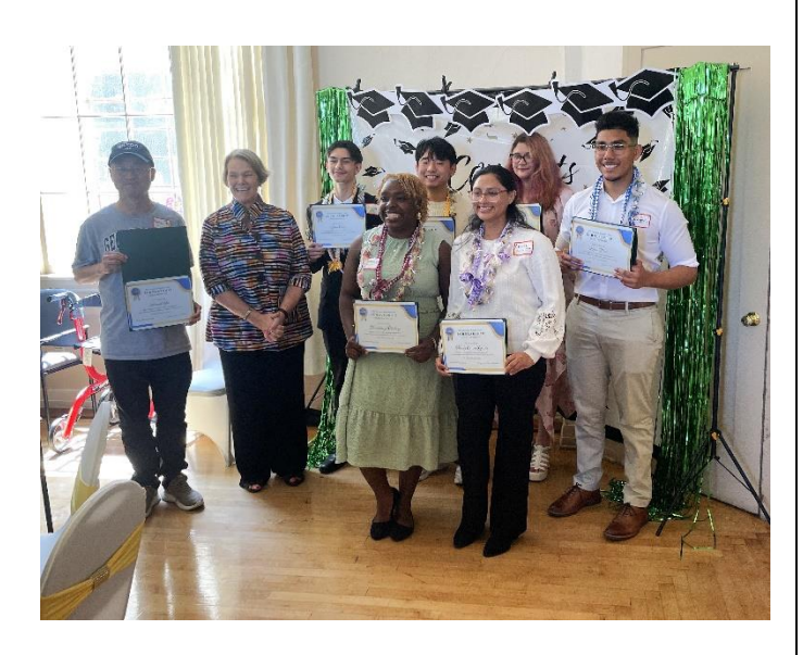
May Scholarship Luncheon