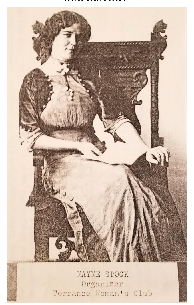
TWC's First President